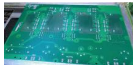
PCBA before Coating

Assisted with blue-ray detection technology, PCBA coating quality is significantly improved.