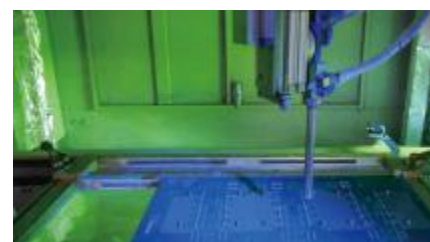
PCBA after Coating